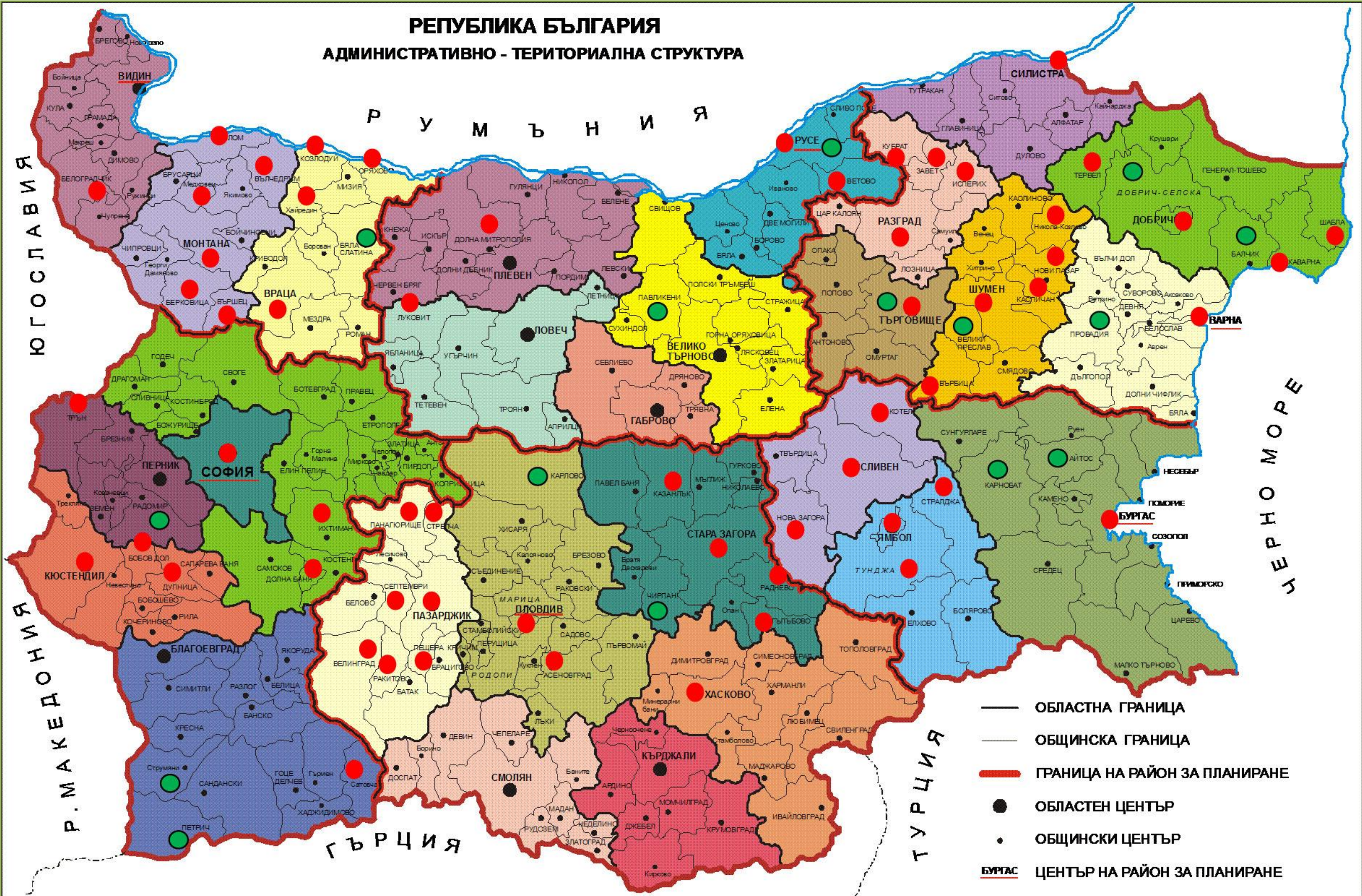
A map of Bulgaria